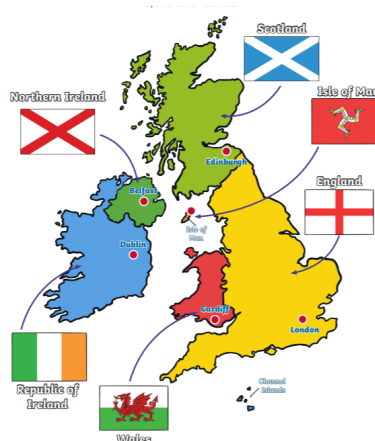
The countries of the UK and their capital cities .