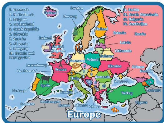
The countries of Europe